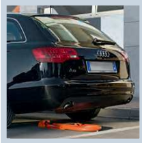
The easiest way to save your car park place