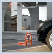
Automation that safeguards the private car parks