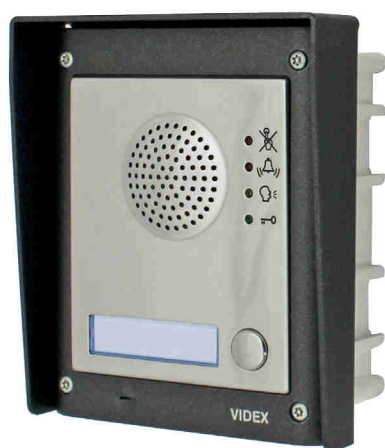
ART.4871 + ART.4851